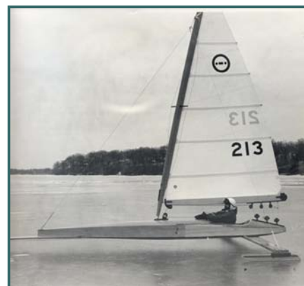
5 nights in the Mattison shop and a gallon of Gougeon later, R-213 is back on the ice